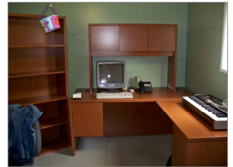
Desk, credenza, return and book shelf now fill the child care center director's office.

To learn more about the WTLC, please go to http://www.wtlc.org/ .