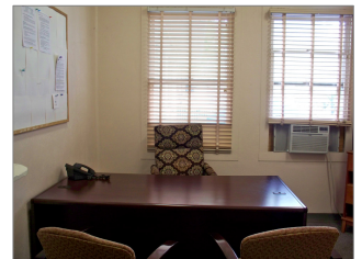
A desk arrives and is used in the consultation office.